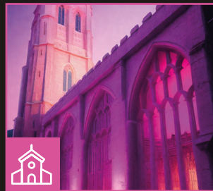
The Unfolding SLX & Bristol Light Festival