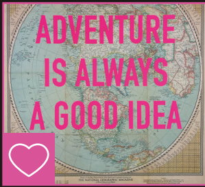
Bristol is always a Good Idea