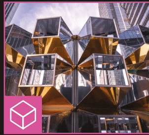
Emergence This is Loop

A huge, mirrored structure, completely reflective to provide audiences with a new perspective of a once-familiar space. Intended to act as a place of contemplation amongst the chaos of the outside world.