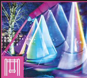
Swing Song Tired Industries & Bristol Light Festival

Bristol Light Festival's very own Swing Song is back! A set of six interactive swings which light up and play music as you swing back and forth. Swing high for a crescendo or gently for more ambient vibes.