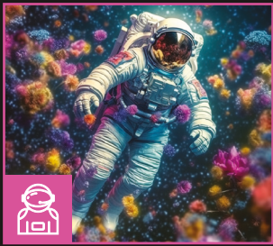
Ascendance Studio McGuire

A World Premiere for Bristol Light Festival by Studio McGuire, this interstellar installation depicts an astronaut floating in an imaginary galaxy of blooming flowers and shooting stars.