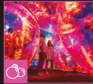
Evanescent Atelier Sisu

Immerse yourself in the giant inflatable bubbles which have appeared in College Green. Evanescent by Australian artists Atelier Sisu encourages audiences to explore our delicate world with a sense of play and wonder.