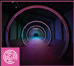
Pulse This is Loop

Pulse is a 40-metre long immersive, audio-visual installation made up of more than 14,000 individual LEDs. Step inside enormous rings of light and experience a new perspective on Bristol.