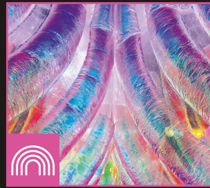
Elysian Atelier Sisu