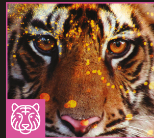
WildLight BBC Studios & Bristol Light Festival

Take a walk on the wild side as animals escape our TV screens into the streets around us. In this new collaboration with Bristol Light Festival, we celebrate BBC's Natural History Unit who have been based in Bristol since 1957.